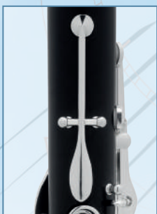
12 th key

This clarinet comes equipped with Valentino pads, preferred by many clarinetists and recommended by experienced repairers for their seal, stability and durability.