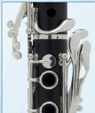
Optional E-flat lever